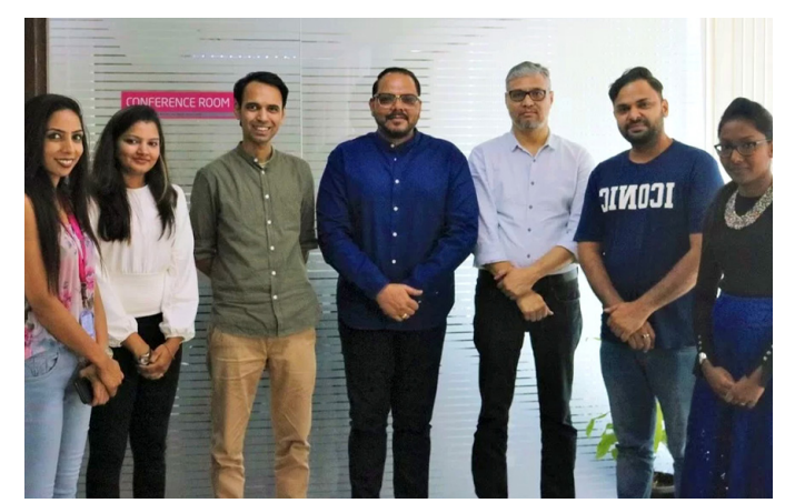
H & M